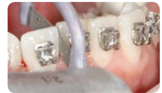
The Orthospace System can be used during treatment.